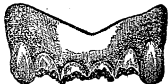
Illustrates four decayed teeth.