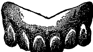
Showing the work completed.