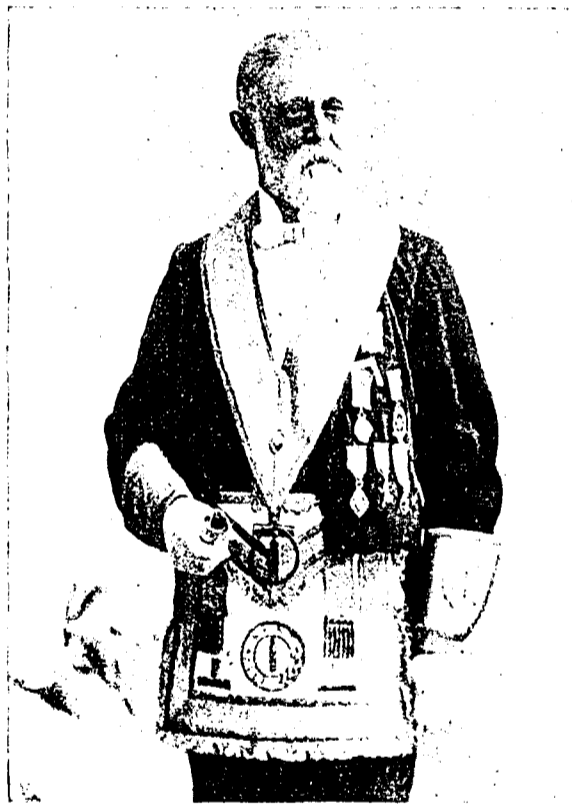
THE WORSHIPFUL MASTER.